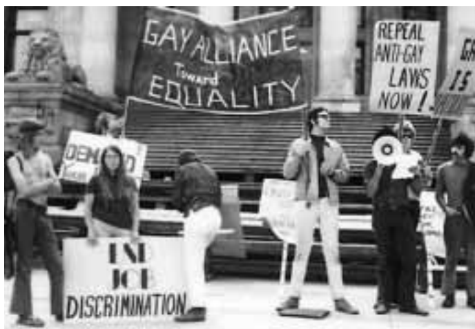
"We Demand," Courthouse, Vancouver, 28 August 1971

In May, at the CHA annual meeting in Waterloo, the CCHS will award its prize for the best article on the history of sexuality in Canada published in 2010 or 2011. For a list of past prize recipients, and for information on how to join the CCHS's email list, check out our website!