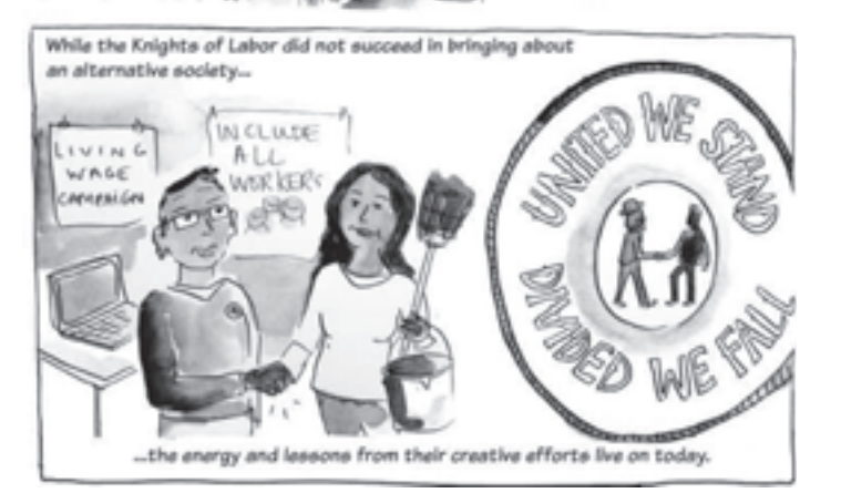
Page 2 from Dreaming of What Might Be: The Knights of Labor in Canada, 1880–1900 (http://graphichistorycollective.com/graphic-historyproject/comic-1-dreaming-of-what-might-be-knights-of-labor)

The Knights encouraged people to dream of "what might be" and to take action rather than give in to the poor conditions and lack of control others said were natural and unchangeable.