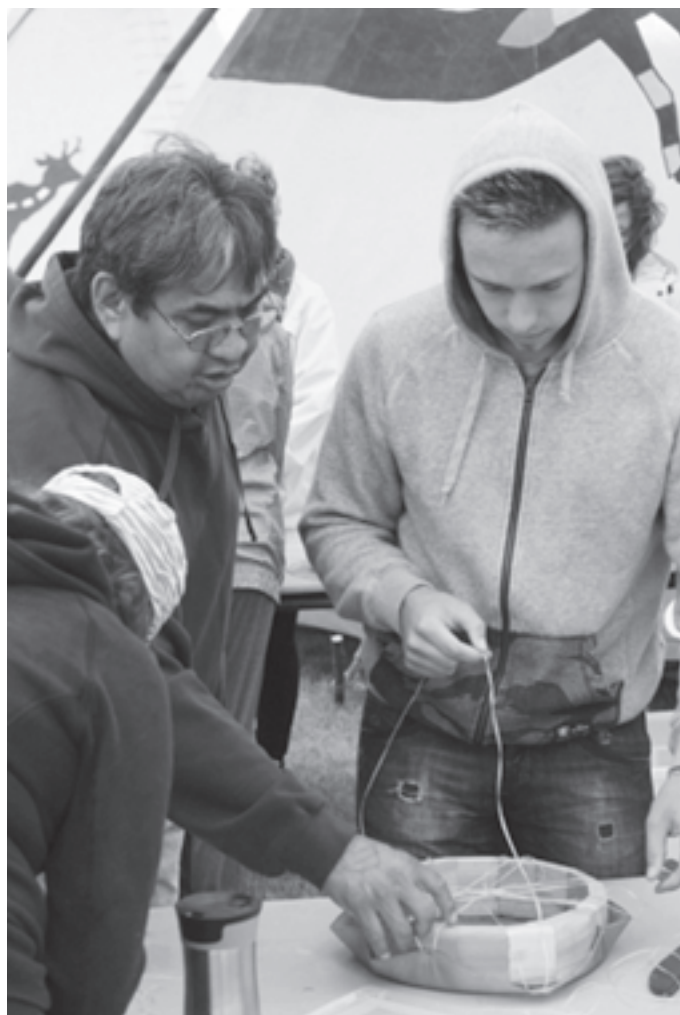
Drum Making / Fabrication de tambour