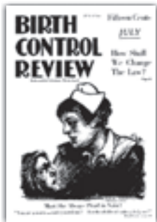
Mensuel Birth Control Review 1919