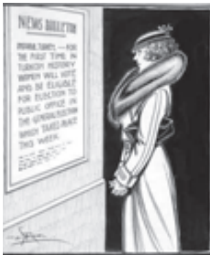
Canadian political cartoon of a woman in Quebec reading a sign / Caricature politique canadienne d'une femme au Québec faisant la lecture d'un panneau 1930