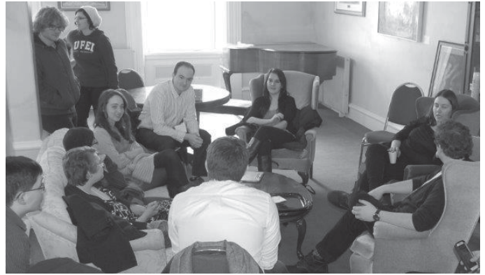
Some of the 40 students from 7 Atlantic Universities discuss their work at the Atlantic Universities Undergraduate History & Classics (AUUHC) Conference hosted by the University of Prince Edward Island History Department in March 2014. / Quelques-uns des 40 étudiants des universités des provinces atlantiques discutent lors de la Atlantic Universities Undergraduate History & Classics (AUUHC) Conférence organisée par le département d'histoire de l'University of Prince Edward Island en mars 2014.